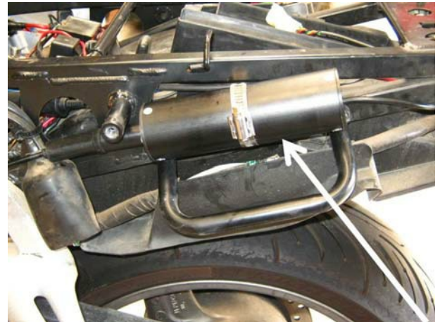
The Electric Throttle Servo (2) is mounted on the left side of the bike, under the seat fairing panel. The photo below shows the bike with the seat fairing fitted above with the servo mounted to the frame without the panel fitted. A cable connects it to the CIU (3).