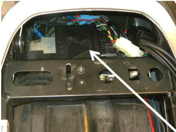
The Computer (1) shown left mounts in the rear luggage compartment in front of the rear light using Velcro mounting tape.

Note: - A suitable bolt to seal the bike's fuel injection pressure hose is provided in the kit allow safe removal and refitting of the fuel tank. New sealing washers should be purchased from your dealer for the fuel injection hose and fuel tank service bolt.